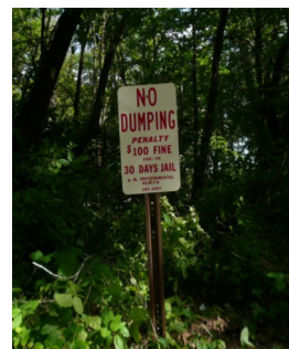
Picture 1: Taken Tuesday May 18th Picture 2: Taken Wednesday May 19th